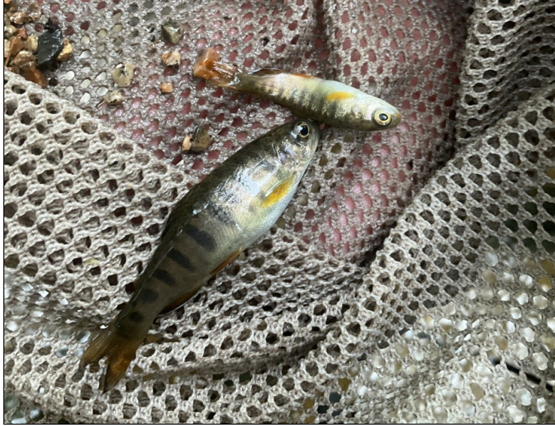
Figure 1.—Juvenile coho salmon captured at waypoint 1510.