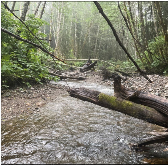
Figure 2.—Channel at waypoint 1510.