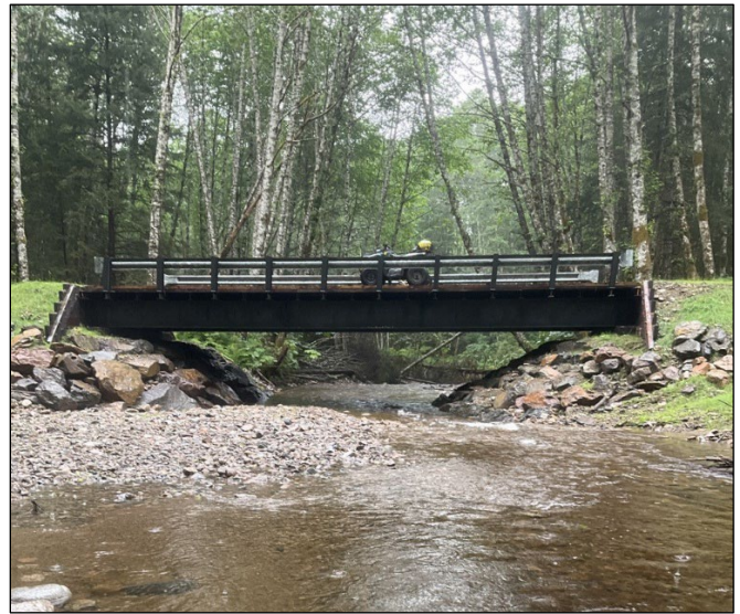
Figure 3.—Bridge at waypoint 1510.